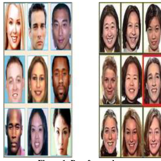
Figure 1: Pass faces scheme

must be executed correctly. The set of images in a panel remains constant between logins, but images are permuted within a panel, incurring some usability cost. The original test systems had n = 4 rounds of M = 9 images per panel, with one image per panel from the user portfolio. The user portfolio contains exactly 4 faces, so all portfolio images are used during each login. The theoretical password space for Passfaces has cardinality Mn, with M = 9, n = 4 yielding 6561 _ 213 passwords.